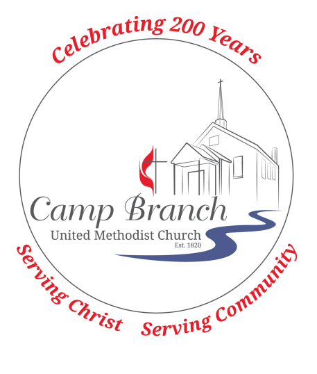
Welcome to Camp Branch UMC! If you are visiting with us for the first time, below are a few things you may find helpful.